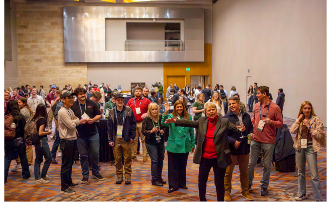
WAAIME Student Reception at the SME Annual Conference February 2025