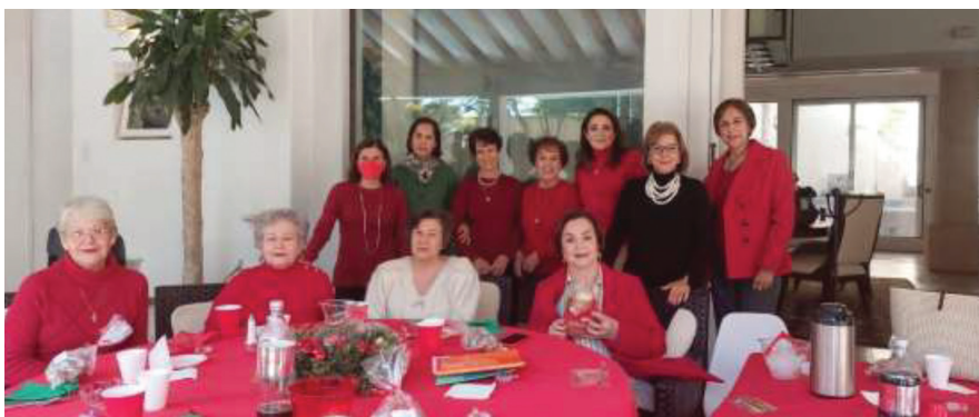
Mexico-Torreon members met in March for breakfast and conviviality.

In May we will have another face-to-face meeting, when we will celebrate Mother's Day. ■