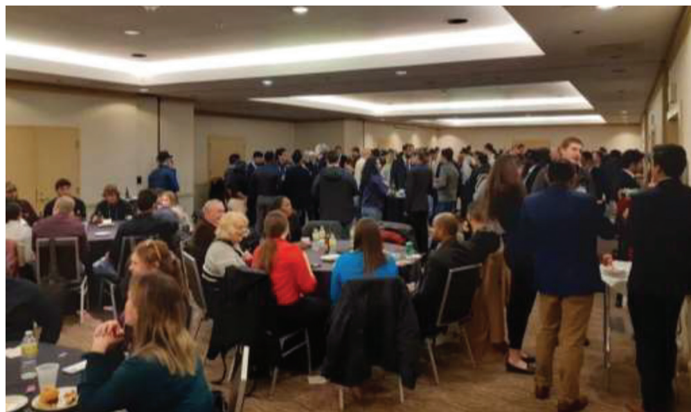
The WAAIME Students Reception saw a tremendous turnout.

uncertainties that are affecting the economy worldwide (inflation, Omicron wave, US-Russia tensions over Ukraine, US-China tensions), our portfolio remains relatively stable. At the writing of this summary, the most recent update of our portfolio that we have received as of March 31, 2022 stands at $10,340,533.88. However, UBS still expects market volatility for the remainder of 2022. Currently, the WAAIME portfolio is made up of 9.2 percent cash, 24.2 percent fixed income, 62.7 percent equities and 3.8 percent in Atlas, a hedge fund.