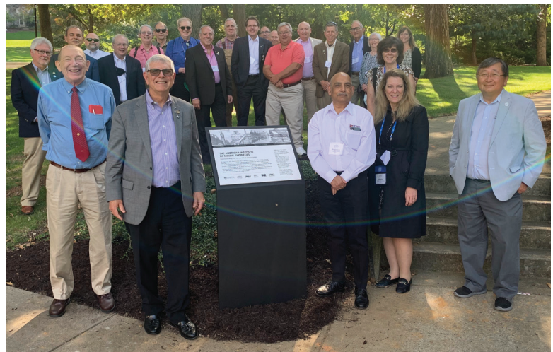
Dedication of commemorative plaque at Lehigh University campus.

and-member-society-leadership-install-plaque-lehigh-university-150th-0. Congratulations to AIME on 150 years. ■