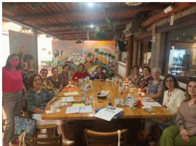
13 ladies attended the first face-to-face meeting this year.

This has been a year with many fruits, and with a lot of participation from all our partners despite the COVID-19 pandemic. ■