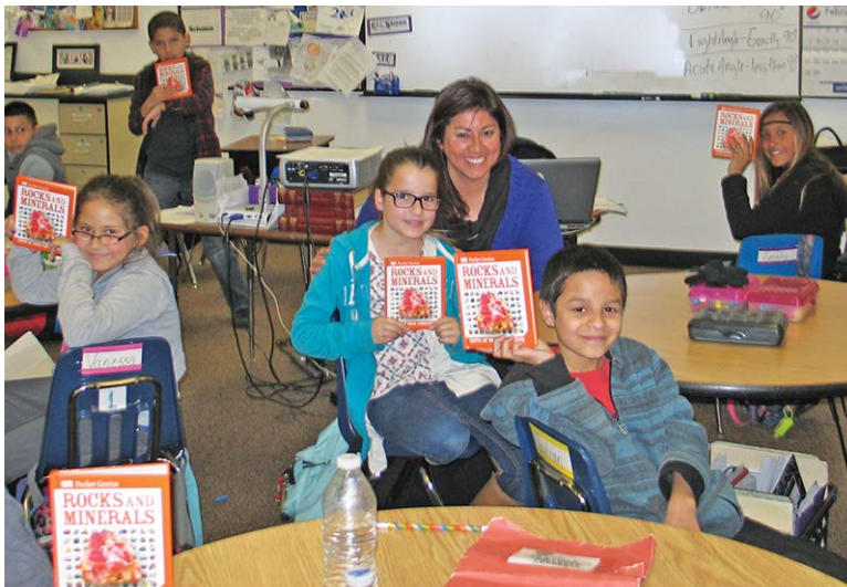
Rocks and Minerals books donated by the Pinal Mountain Section were well received by students and teachers in the local Arizona schools.

The ladies of the Pinal Mountain Section have not been idle. With the generous support of Freeport-McMoRan, Miami Operations, the section was able to distribute 550 books entitled Rocks and Minerals to every fourth grade student in the Globe, Miami, Superior, Kearny, Hayden, San Carlos and Fort Thomas, AZ schools. This was the sixth year the section was able to provide this reference book to students in an effort to get them excited about geology and to encourage a possible interest in a career in the mining industry.